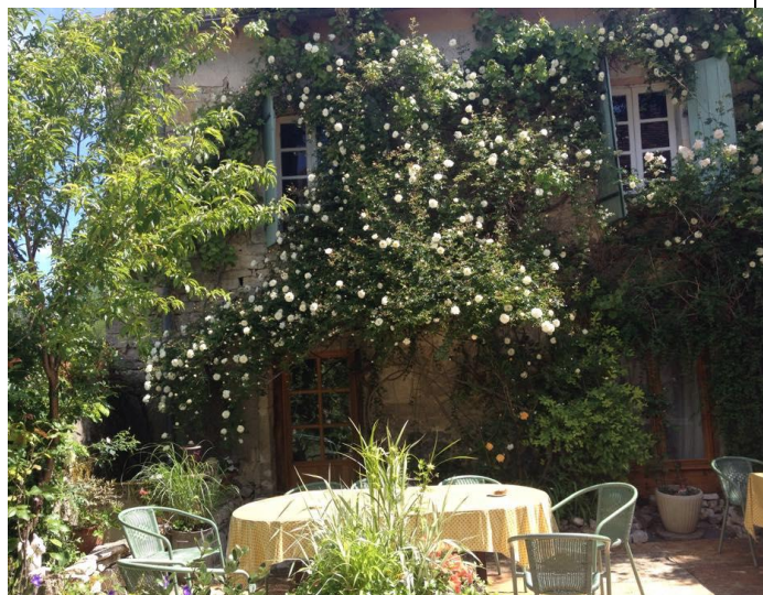
Le Vieux Couvent, Frayssinet, southwest France