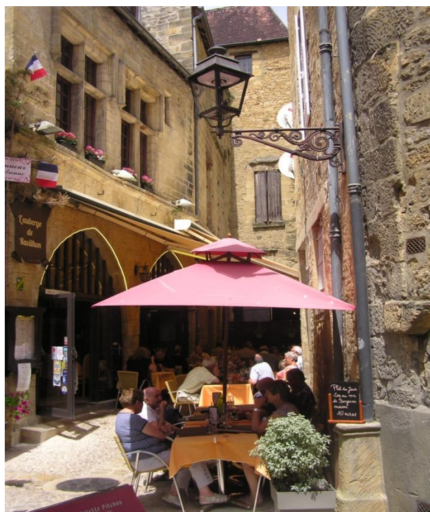
Village of Sarlat. France.